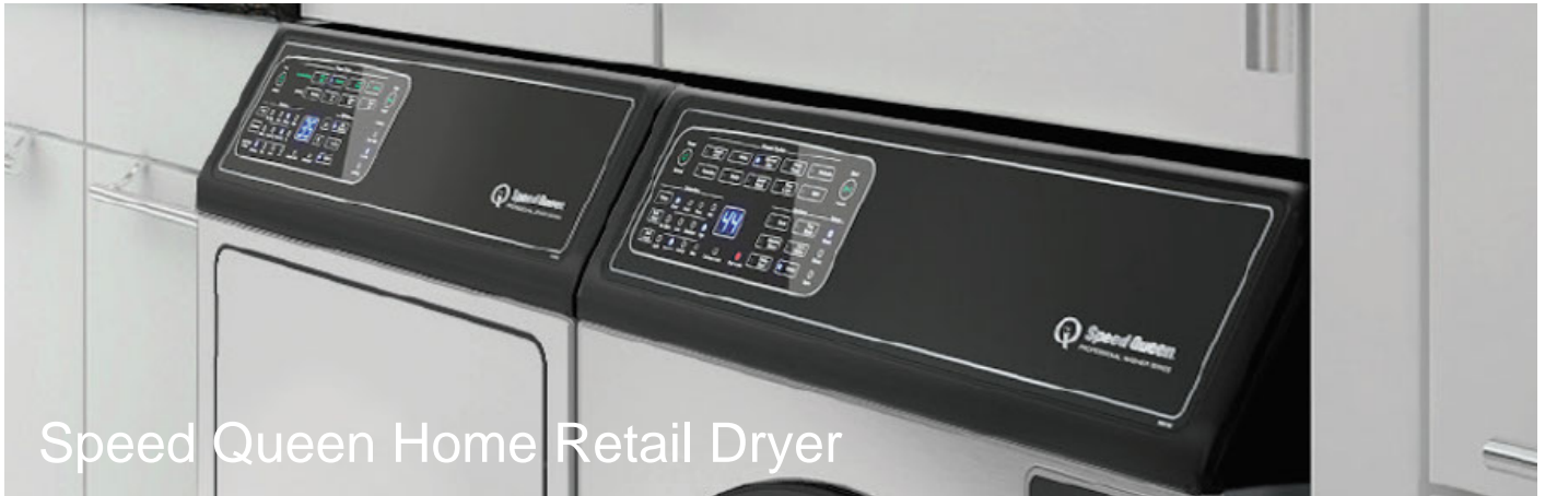
Speed Queen Home Retail Dryer